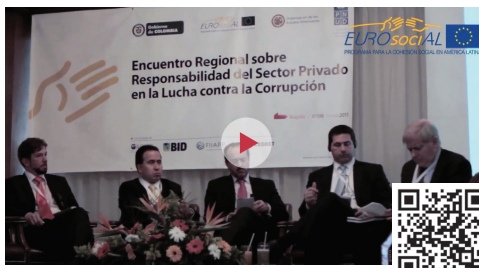
Good practices forum about the fight against corruption