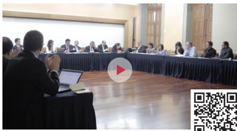
Inter-institutional coordination in the fight against corruption